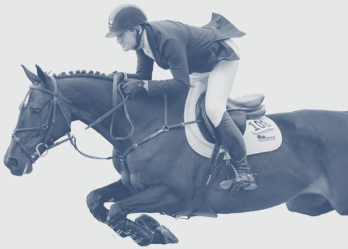
Mclain Ward USA

Former World #1, with Olympic, World Championship, and Pan American Games gold medals, as well as FEI World Cup Finals Winner, Rolex Grand Prix winner, and countless CSI5* Grand Prix victories.