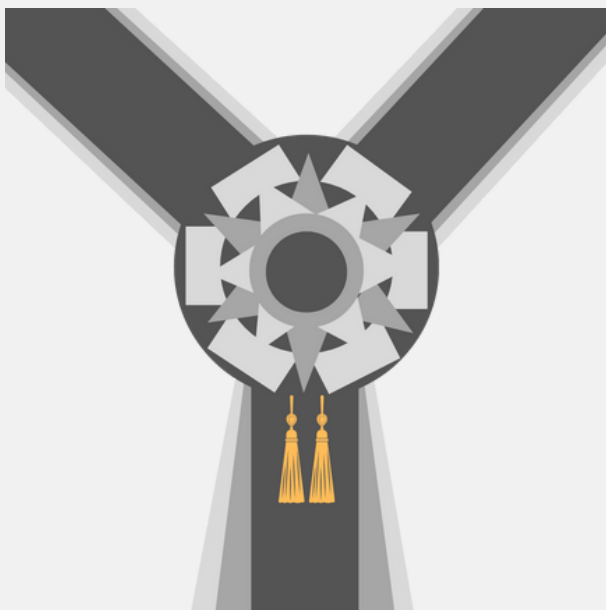
Option #3 - Hodges Neck Sash